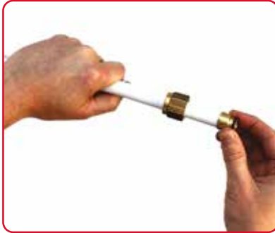
5. Push the fitting as far as it will go into the bevelled end of the pipe.