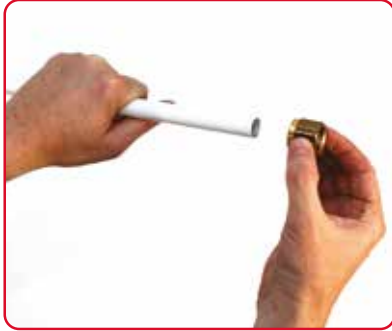
4. Place nut onto the pipe.