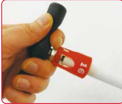
2. Bevel the cut end of the pipe.