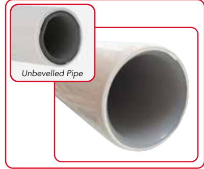
3. Check to ensure there are no burrs.