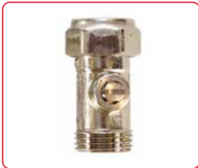
Standard Isolating Valve available from any plumbers merchant.

Maincor Connectors are the simple, easy way to connect Multi-Layer Composite Pipe to wide range of industry standard valves, radiator connections and threads. No special valves required!