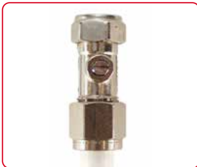
Compression connector being used to connect MLCP to the Isolating valve.