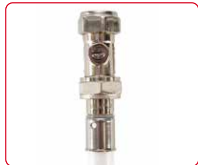
Alternatively use Multi-Fit (see next page) to make the connection to the Isolating valve.