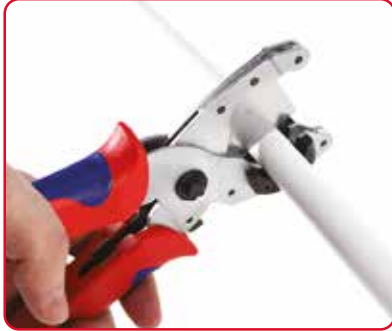
1. Cut the pipe at a 90° angle.

When installing plumbing systems ensure that all relevant health and safety legislation and local site regulations are fully adhered to at all times.