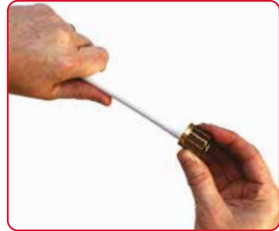
6. Fitting is now ready to tighten onto threads with straight BSP connections. Tighten the nut by hand until you meet resistance then use professional wrenches to further tighten to a torque of 40 Nm.

Always check the inside of the pipe after bevelling to ensure there is no plastic waste from the bevelling process present. If using a drill when bevelling the pipe, ensure the max revolutions are less than 500/min and allow tooling to cool between each procedure.