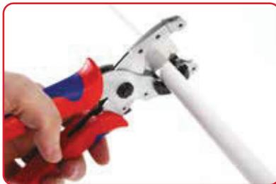
1. Cut the pipe at a 90° angle.