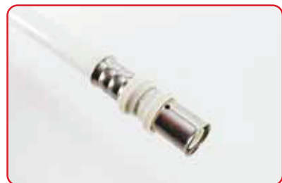
6. Joint Complete.

Always check the inside of the pipe after bevelling to ensure there is no plastic waste from the bevelling process present. If using a drill when bevelling the pipe, ensure the max revolutions are less than 500/min and allow tooling to cool between each procedure.