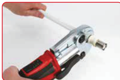
5. Using a standard Maincor 'U' profile press jaw and press tool, make the connection.