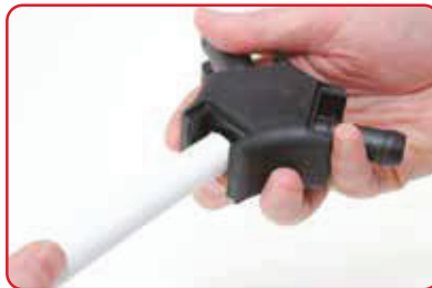
2. Bevel the cut end of the pipe.