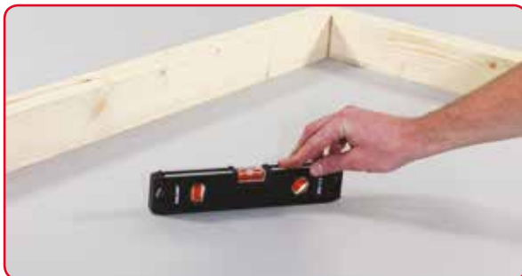
1. Ensure floor is level.