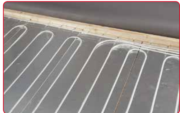
3. Roll-out the 12mm pipe into the required pattern and fit into the grooves.