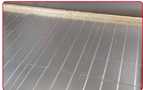
2. Boards in place.